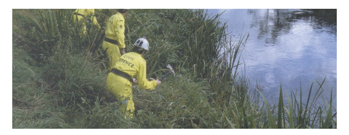
Personnel and Training