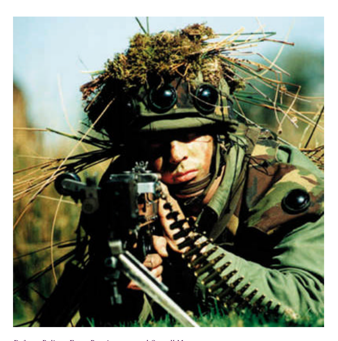
Defence Policy - Force Requirements and Overall Manpower

The Government accept the continuing validity of these judgments. The Defence Forces will continue to be developed to ensure the retention of a conventional military organisation to meet current and contingent requirements.