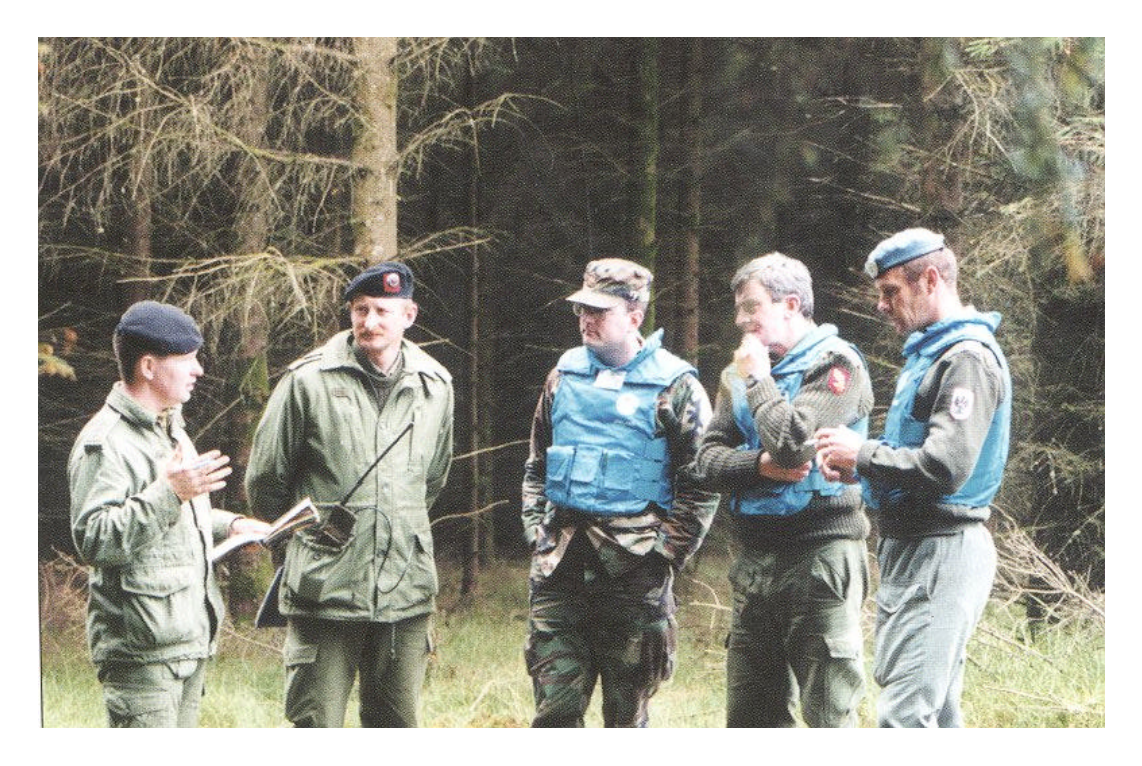
Other Types of Overseas Participation

Ireland will accede to the Convention which came into force on 15 January 1999. The purpose of the Convention is to secure the better protection of personnel engaged in UN efforts in the fields of preventive diplomacy and other peace support operations. The relevant Bill has been published by the Minister for Justice, Equality and Law Reform and will be progressed as quickly as possible.